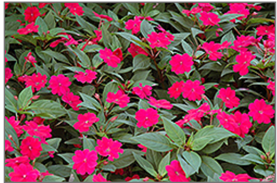
Bounce Cherry Impatiens in bloom