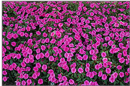
Bounce Pink Flame Impatiens in bloom