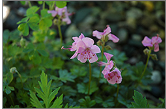
Claridge Druce Cranesbill flowers

Claridge Druce Cranesbill is recommended for the following landscape applications;