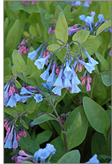
Virginia Bluebells flowers