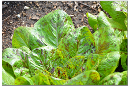
Freckles Romaine Lettuce foliage

Freckles Romaine Lettuce will grow to be about 10 inches tall at maturity, with a spread of 9 inches. When planted in rows, individual plants should be spaced approximately 6 inches apart. This vegetable plant is an annual, which means that it will grow for one season in your garden and then die after producing a crop. Because of its relatively short time to maturity, it lends itself to a series of successive plantings each staggered by a week or two; this will prolong the effective harvest period.