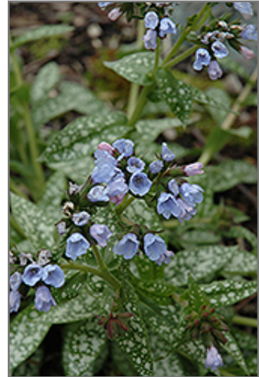
Roy Davidson Lungwort flowers