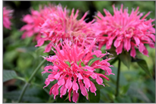
Coral Reef Beebalm flowers

Coral Reef Beebalm is recommended for the following landscape applications;