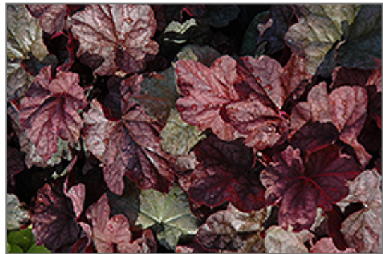
Beaujolais Hairy Alumroot foliage