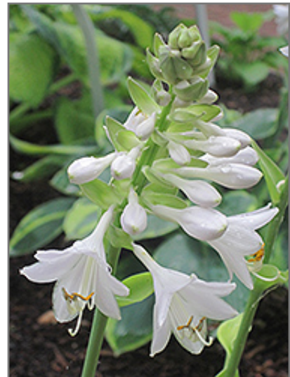
King Tut Hosta flowers