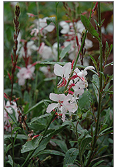
Ballerina Blush Gaura flowers

Ballerina Blush Gaura is recommended for the following landscape applications;