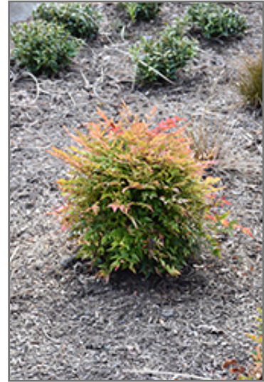
Gulf Stream Dwarf Nandina