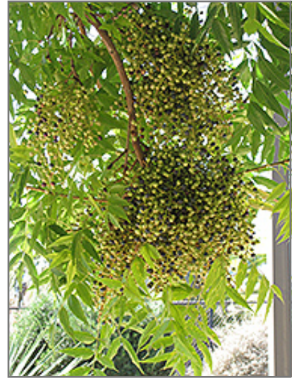
Chinese Pistache fruit

This tree should only be grown in full sunlight. It is very adaptable to both dry and moist growing conditions, but will not tolerate any standing water. It is not particular as to soil type or pH. It is highly tolerant of urban pollution and will even thrive in inner city environments. This species is not originally from North America.