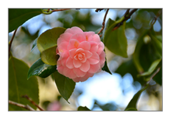
Otome Camellia flowers

(336) 288–8893 newgarden.com New Garden Gazebo 3811 Lawndale Dr. Greensboro