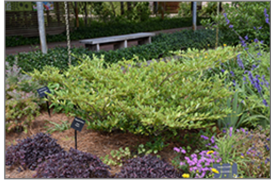
Vintage Jade Witch Hazel