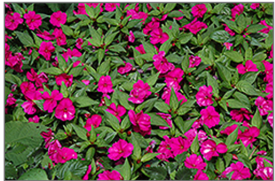
Big Bounce Violet Impatiens in bloom