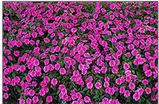
Bounce Pink Flame Impatiens in bloom