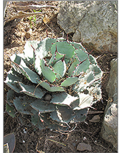
Butterfly Agave

This variety makes a great indoor accent with its dramatic gray-green foliage that is reflexed back, with chestnut brown spines; may take many years to bloom, then plant dies, rarely leaving offsets; it is very spiny so handle and locate with great care