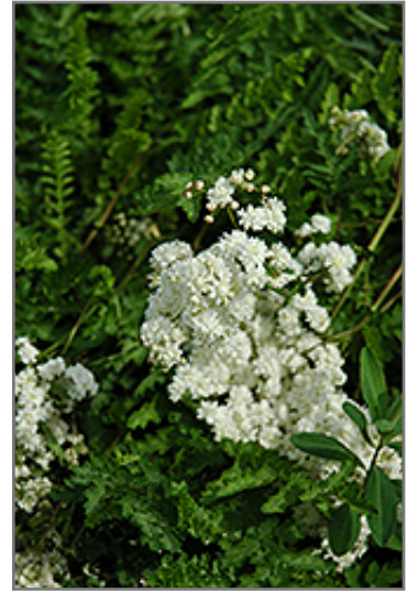
Double Dropwort flowers

Clusters of small white double flowers rise tall above a base of deep green toothy foliage; low maintenance plants, great for borders, beds, containers or used in fresh-cut arrangements; drought tolerant once established