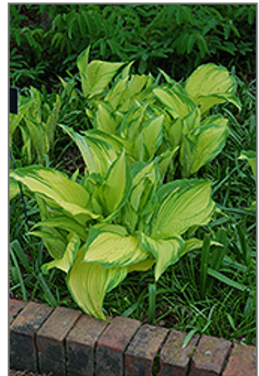
On Stage Hosta