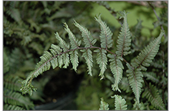
Applecourt Painted Fern foliage