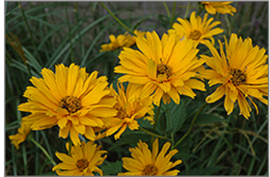
Ballerina False Sunflower flowers