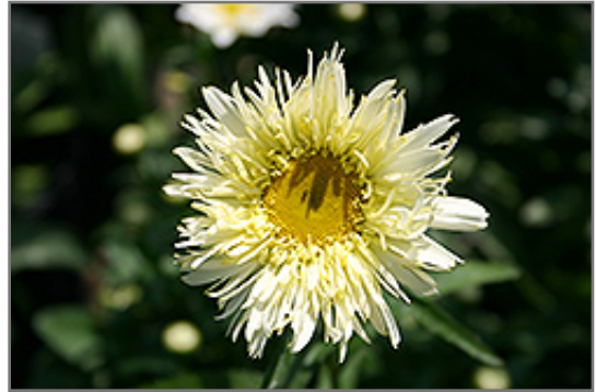
Gold Rush Shasta Daisy flowers

This is a stunning perennial that features fine petalled, semi-double white and yellow blooms with a deep golden eye, all on a compact plant that can be massed in a border or edge planting