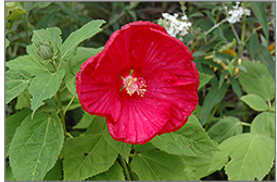
Disco Belle Rosy Red Hibiscus flowers